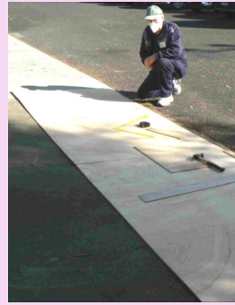
Ian starting Derby Track