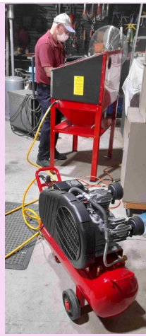
New Sand Blaster